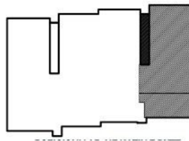
Palazzina tipi "1A/5"